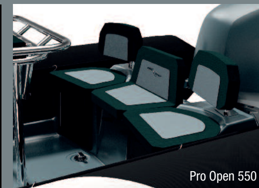
Pro Open 550

The Pro Open 550 has a brand new aft bench seat can accommodate three passengers for improved comfort when boating in all sea conditions. The adjustable/reclinable central seat provides the ability to install a ski mast or fold down the engine a wink/ in a blink of an eye/ in a flash/ simply and quickly/ at a glance.