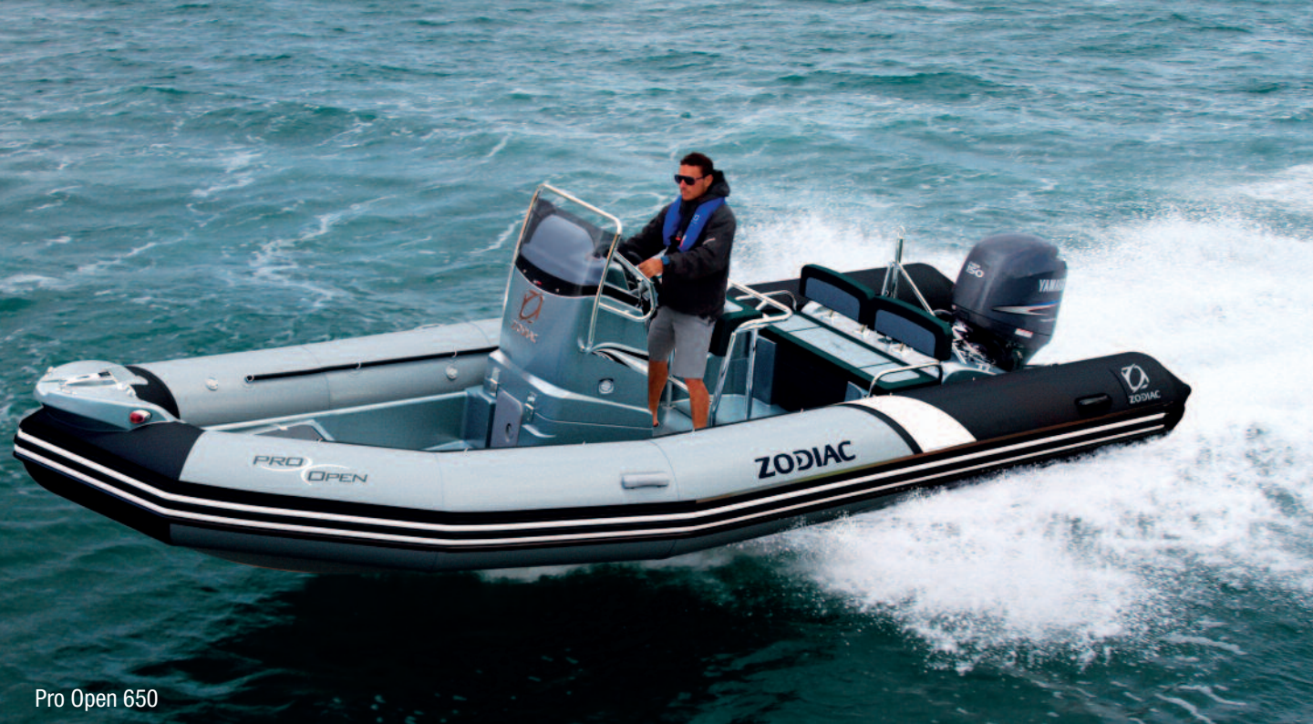
Pro Open 650