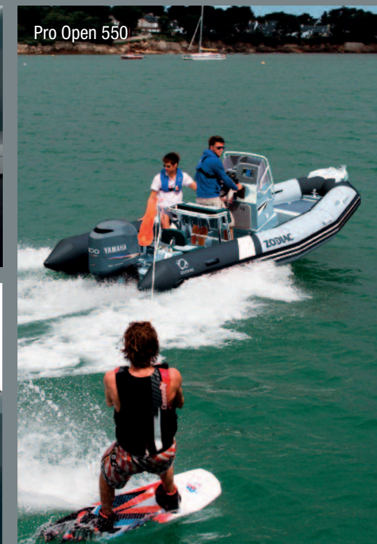
Pro Open 550