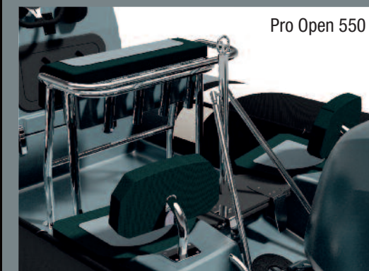
Pro Open 550