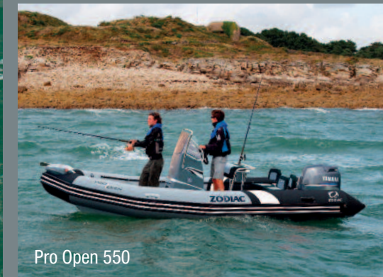
Pro Open 550

The new design of the Pro Open Range is firmly focused on adventure boating/ different way to live the sea, while providing a perfect balance of performance and comfort.