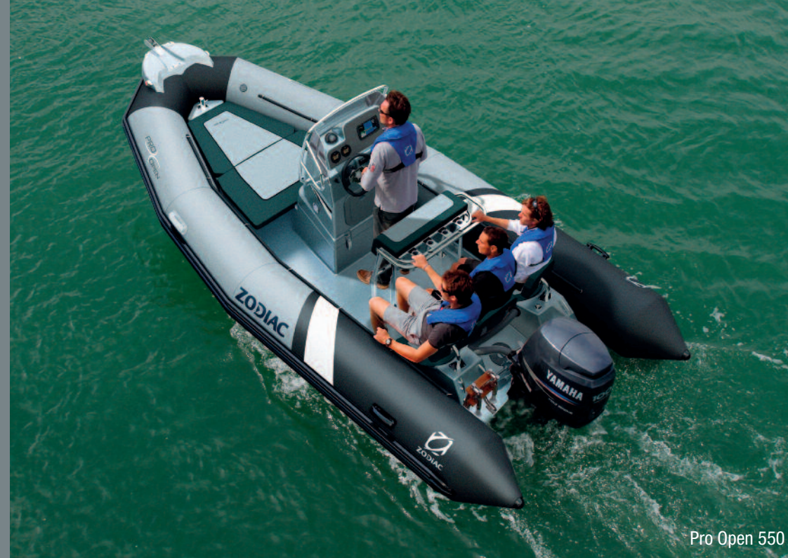
Pro Open 550